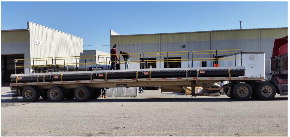
15 m pivot walkway loaded