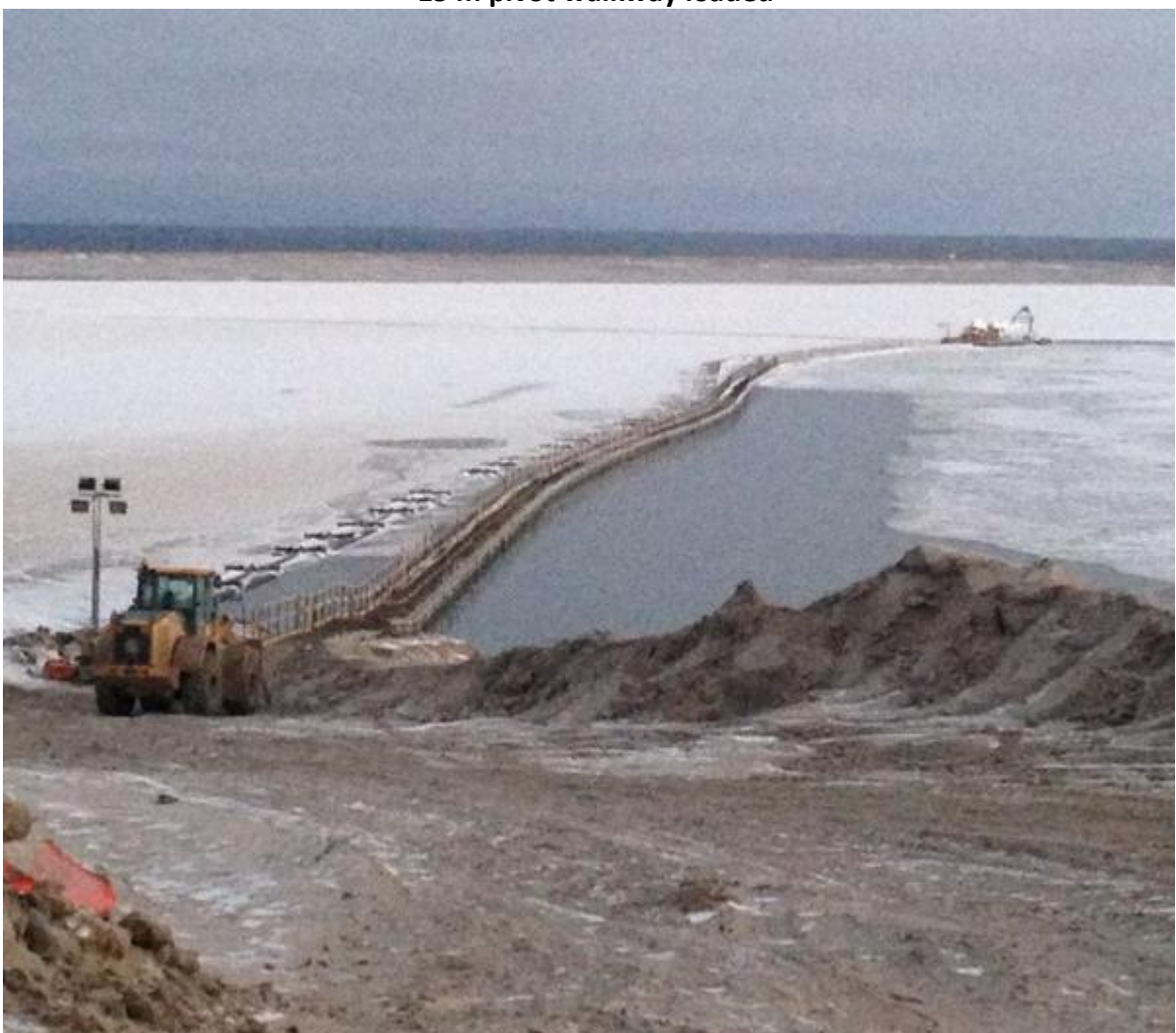
Photo taken from project managers phone the day installation completed. Deicers at work on right side